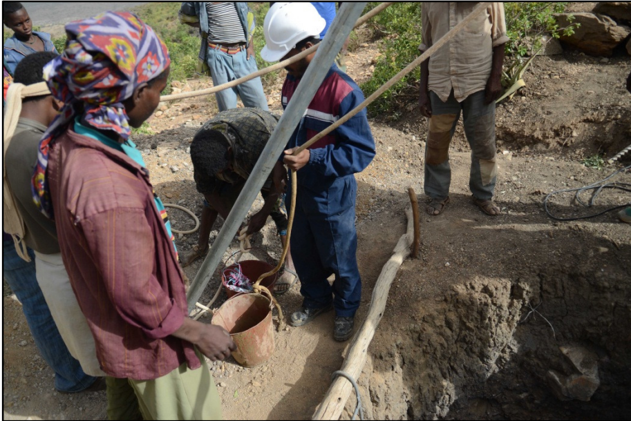
Professionals from REST and local workers prepare for the blast.