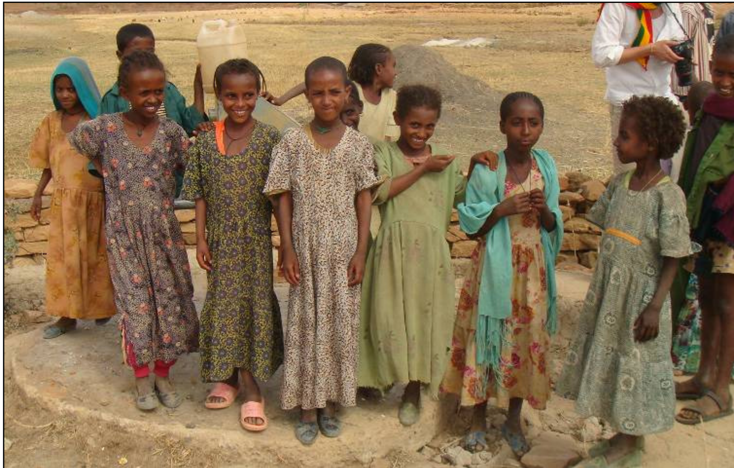
These young girls in Adi Beret were very excited about the new well, especially as it's the women and young girls' responsibility to find and carry home the water.