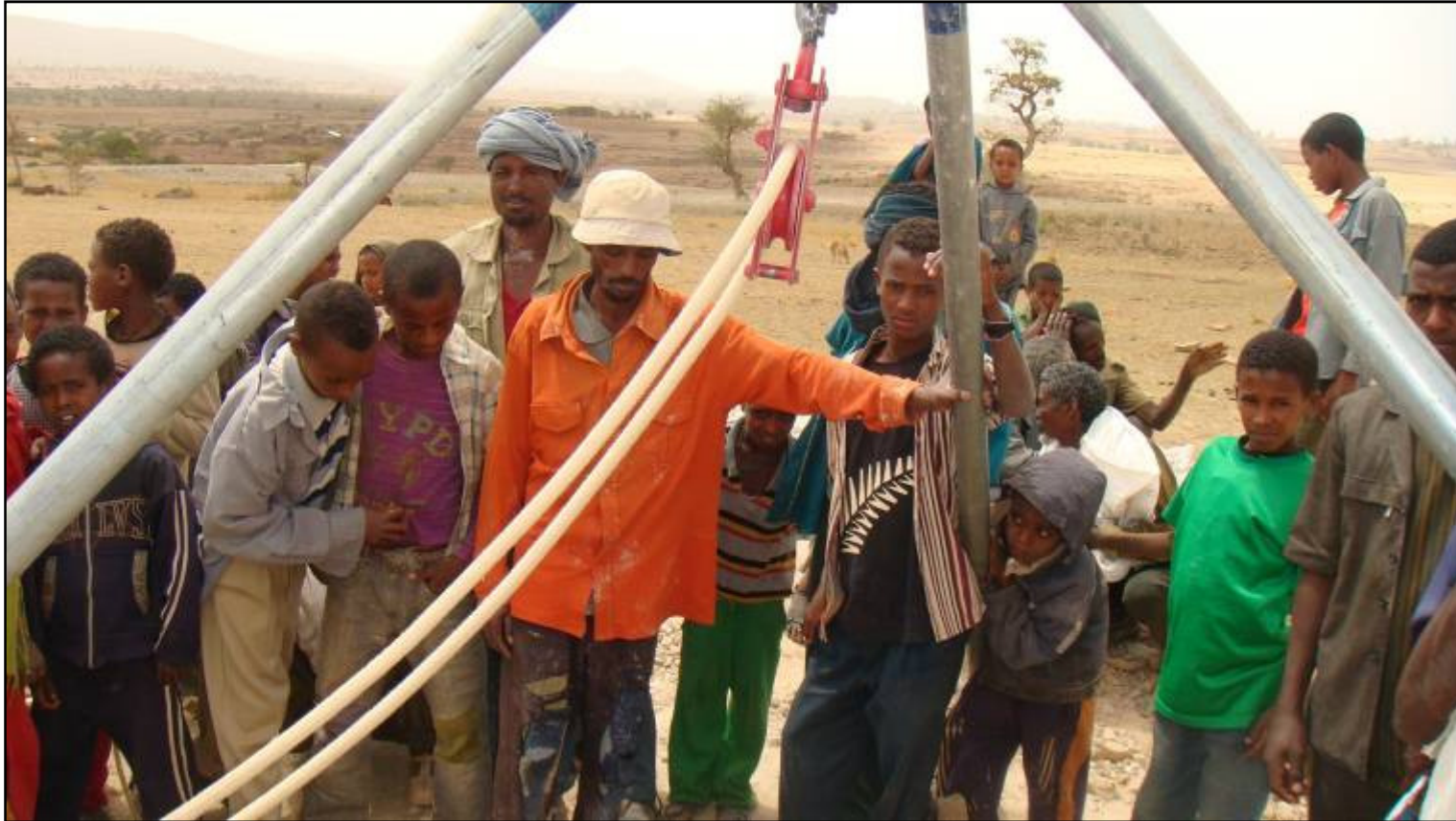
Photos from a June 2012 visit with representatives from Water is Life and A Glimmer of Hope