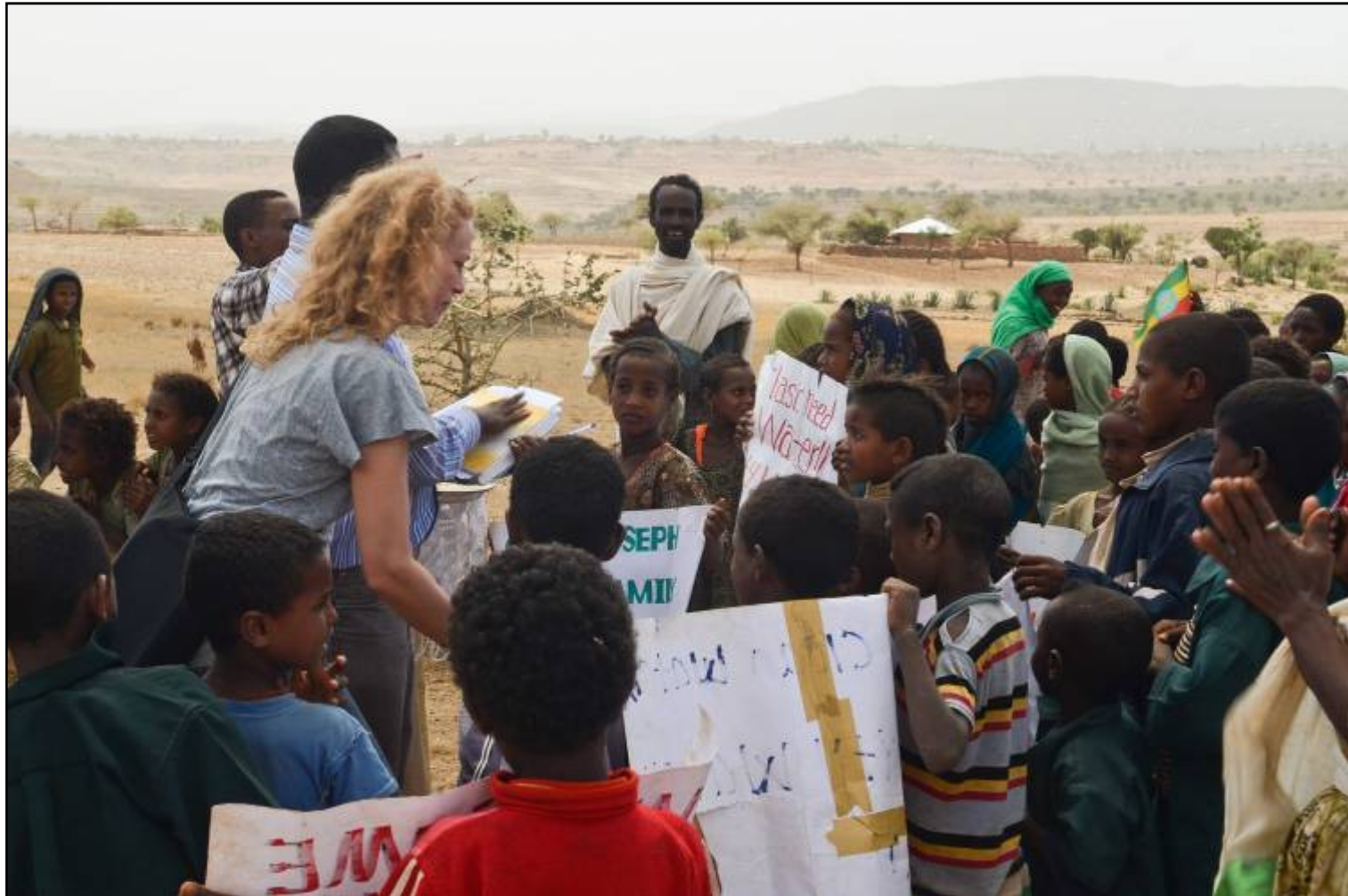
Visit to Adi Beret, Seglamen to see our new well under construction. The young students of a nearby school prepared signs to greet us.